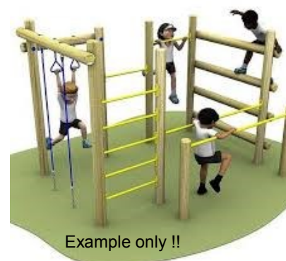
Example only !!